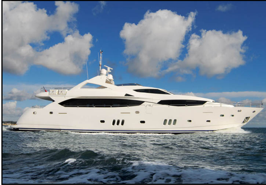
(Sunseeker 37 Mt Tri – Deck Yacht.)