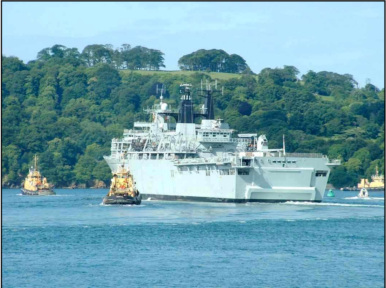
(HMS Albion sailing out of Plymouth Sound Harbour.)

Project HMS Albion 10" & 12" Ballast System